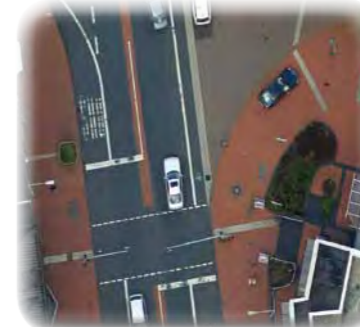
True Orthofoto Automatic generation of true orthos