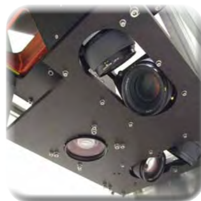
IGI Penta-DigiCAM together with IGI LiteMapper (fitting in aerial hole)