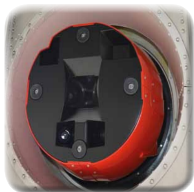
IGI UrbanMapper installed in fixed-wing aircraft