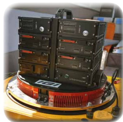
IGI UrbanMapper installed in stabilized mount GSM-3000

IGI's Custom Solution mission is to provide our customers with a unique and leading system. We offer an array of solutions including stabilized mount support, LiDAR, hyperspectral and thermal camera integrations as well as custom solutions for fixed-wing aircrafts, helicopters, gyrocopters and UAV/RPAS platforms.