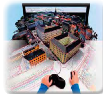
3D Stereo Plotting Easy 3D Stereo vector digitizing e.g. with Summit Evolution™

Together with several industrial partners, IGI provides an integrated workflow for the generation of orthophotos, 3D stereo vector digitizing and a full automatic workflow for the production of 3D city models.