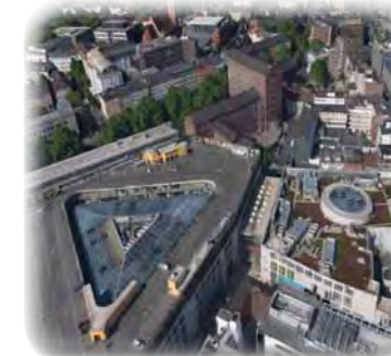
3D City Model Automatic generation of 3D city models with IGImatch or RhinoCity