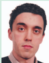
Massimo Selva Institute of Applied Physics "Nello Carrara" (IFAC-CNR) Florence, Italy